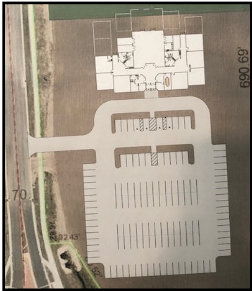
GCA's new building plan and parking lot, as laid out by Fox Cities Builders. This land is in Pulaski off of Pelican Drive.

We've just begun Grace Christian Academy's 8th school year! It's pretty incredible to look back and see all that God has done here and how far we've come with His leading... Our school ministry has 51 students this year (up from 39 last year) so we are very grateful that God blessed us with the additional rental space in our current building that we began renting last March—the space is certainly needed! Our growth has been added confirmation of the Lord's direction to pursue a new school home and there has been a lot of work done towards that end. Our new school lot will be land in Pulaski on the corner of Pelican Drive and Crest Drive. Securing this will be a huge step towards the vision that God has placed on our hearts! Coming soon will be the need to seek funding to build our new school building. While this task seems monumental from a worldly perspective, we know that there is nothing beyond our amazing God and He's got this all securely in His hands! We will praise Him in advance of all He has planned to accomplish!